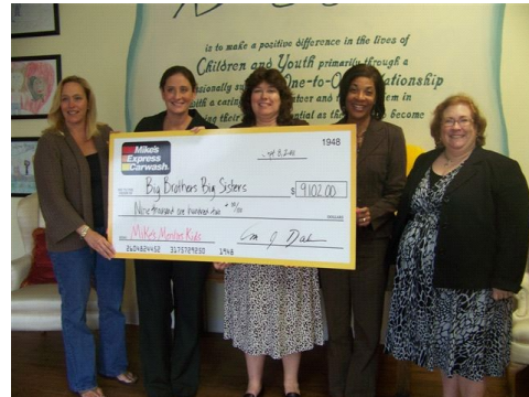
Mike's Carwash presents check to area BBBS Representatives